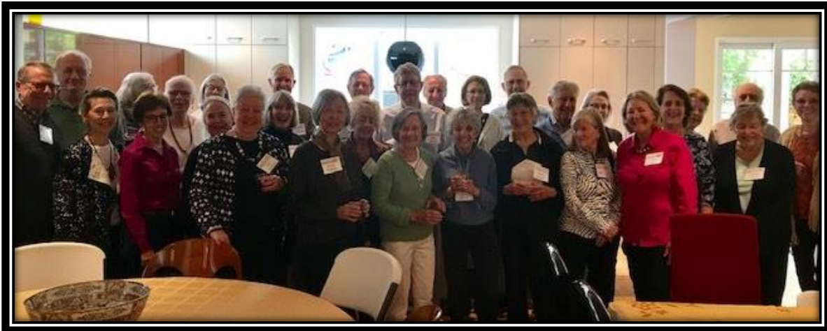
BMAV volunteer recognition luncheon, April 29, 2019